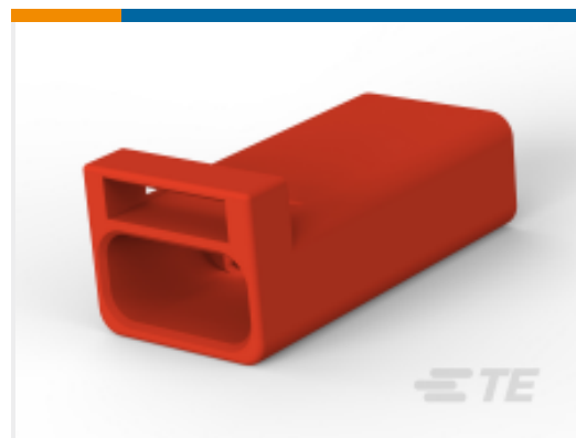
TE Part # 3-2834075-3 3P REC, MINIATURE WATERPROOF CONN.RED